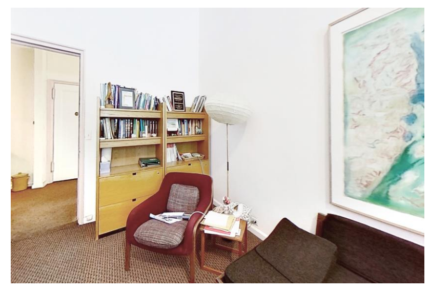
Glass Partitioned Entrance