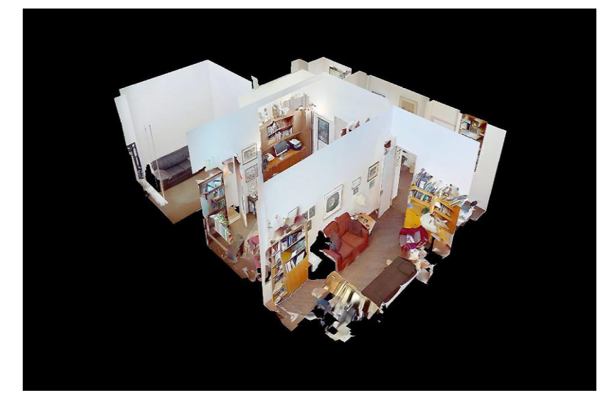
Unit Dollhousse View